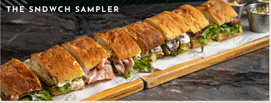
THE SNDWCH SAMPLER

WE CATER INQUIRE TODAY! WWW.SNDWCHMIAMI.COM INSTAGRAM @SNDWCHMIAMI INFO@SNDWCHMIAMI.COM