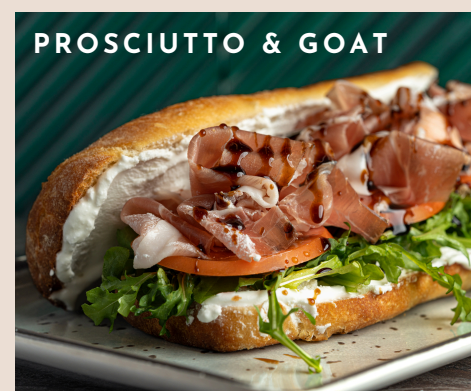
PROSCIUTTO & GOAT

PROSCIUTTO, MOZZARELLA, ARUGULA, TRUFFLE AIOLI