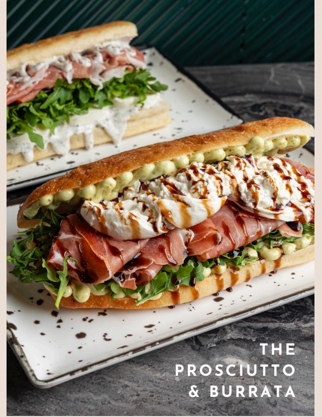
THE PROSCIUTTO & BURRATA