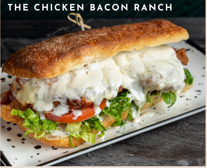
THE CHICKEN BACON RANCH