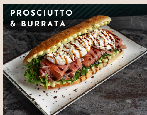
PROSCIUTTO & BURRATA