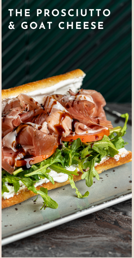
THE PROSCIUTTO & GOAT CHEESE