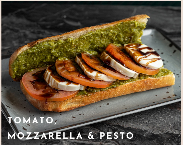
TOMATO, MOZZARELLA & PESTO